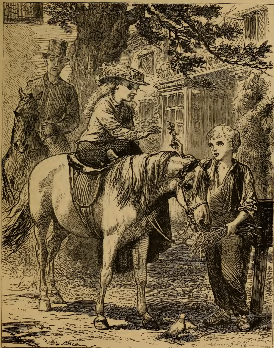
THE WAYSIDE INN.